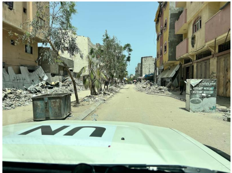
(Photo credit: UNMAS assessing a route used for humanitarian convoys @UNMAS)

To increase the flow of humanitarian assistance, four EOD Officers provided route assessment and EHA of routes used by humanitarian convoys. Notably, the team supported the change of entry of humanitarian personnel and goods by conducting nine route assessments of the roads being used at the Kerem Shalom crossing alone, after the Rafah crossing was closed on 7 May. In this way, due to the efforts of the UNMAS team, the UN and humanitarian sector was able to be responsive to an evolving context and ensure the safe, continued flow of goods and movement of humanitarian actors.