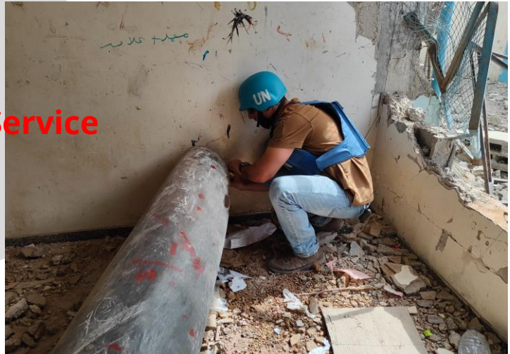
[Photo caption: EOD Officer carrying out an EHA at Al Qarara Elem & Prep Coed School in Khan Yunis ]