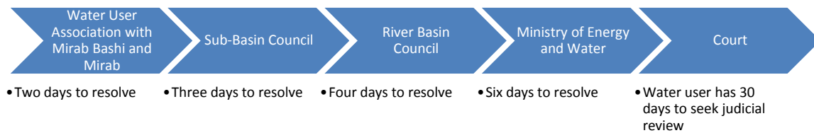
Table 1: Process for resolution of disputes over water use

The Water Law establishes a similar process for resolving disputes between farmers over irrigation networks. When disputes over irrigation networks arise, they are first submitted to the local irrigation association, which has two days to resolve the dispute with the assistance of the mirab and mirab bashi . 119 If the parties do not agree to resolve the dispute in two days, the matter is referred to the sub-basin council, which has three days to resolve the dispute. 120 After three days, the dispute is referred to the river basin council, which has four days to resolve the dispute. 121 If there is still no resolution, the matter is referred to the Ministry of Agriculture, Irrigation, and Livestock, which has six days to resolve the dispute. 122 A farmer who remains dissatisfied with the Ministry of Agriculture, Irrigation, and Livestock’s decision may challenge the decision by filing objections with the primary court within 30 days of the ministry’s final decision. 123 Once again, there is no opportunity for judicial review of disputes over irrigation networks without first exhausting these administrative procedures. 124